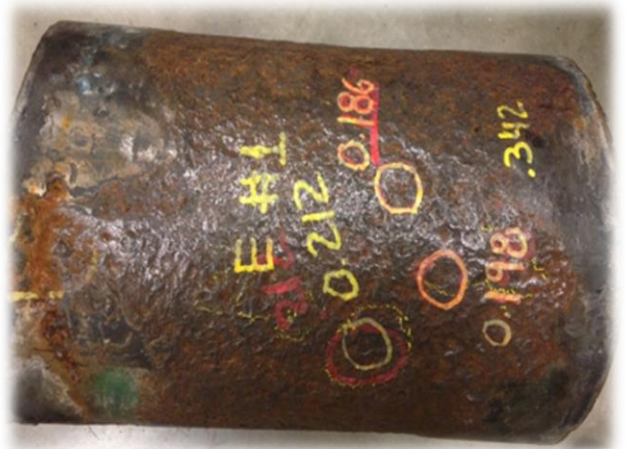
IRISNDT estimated 50% cross-sectional wall loss Follow-up results: 44% wall loss