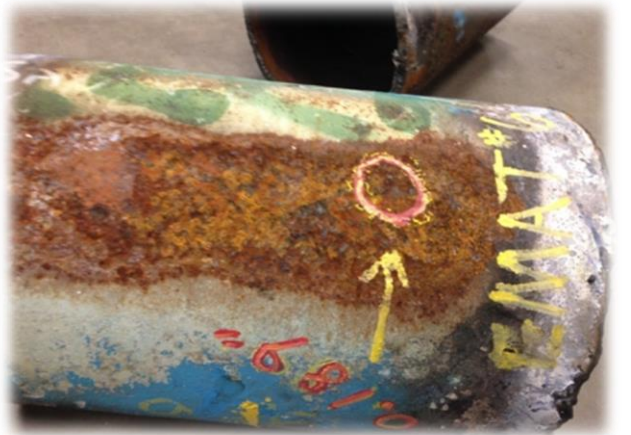
IRISNDT estimated 40% cross-sectional wall loss Follow-up results: 43% wall loss