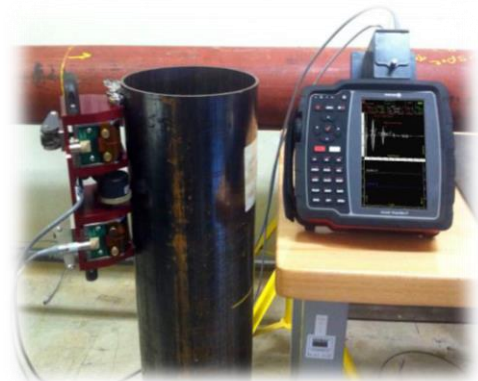
EMAT Guided Wave Reflection Mode – Sending waves axially along the pipe