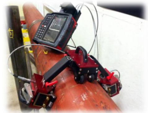
EMAT Guided Wave Attenuation Mode – Sending waves circumferentially along the pipe